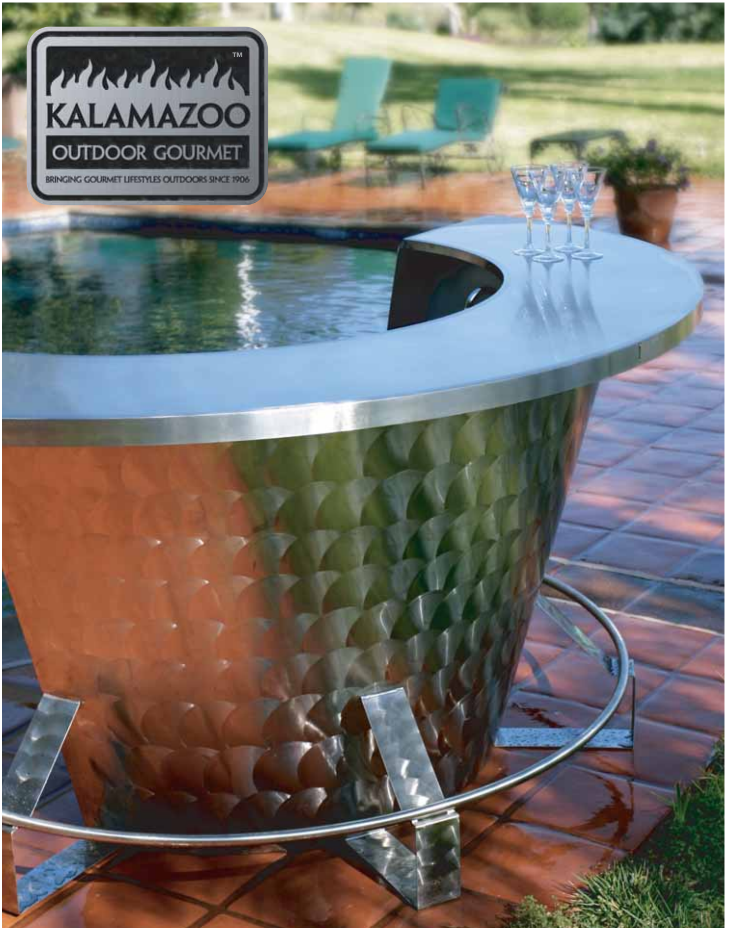
The 180° Martini Bar – A true one-of-a-kind masterpiece of functional art.